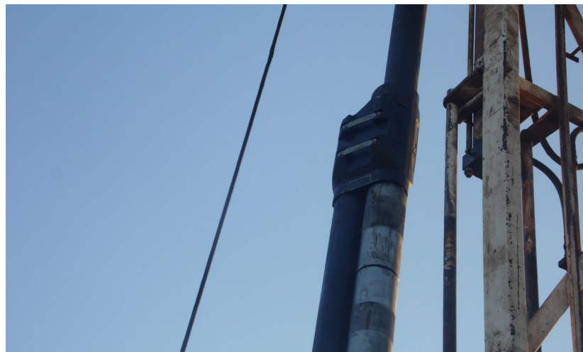
The Y-Tool ESP bypass system enabled water to be produced from one zone and injected into another inside a single wellbore, eliminating the cost and complication of drilling a separate injection well and installing additional surface equipment.

The power dump flood solution was designed to remove water from one downhole reservoir and pump it into the target injection reservoir, eliminating the need for surface water facilities. In effect, the water is diverted from one reservoir to another in order to increase reservoir pressure in the target injection zone.