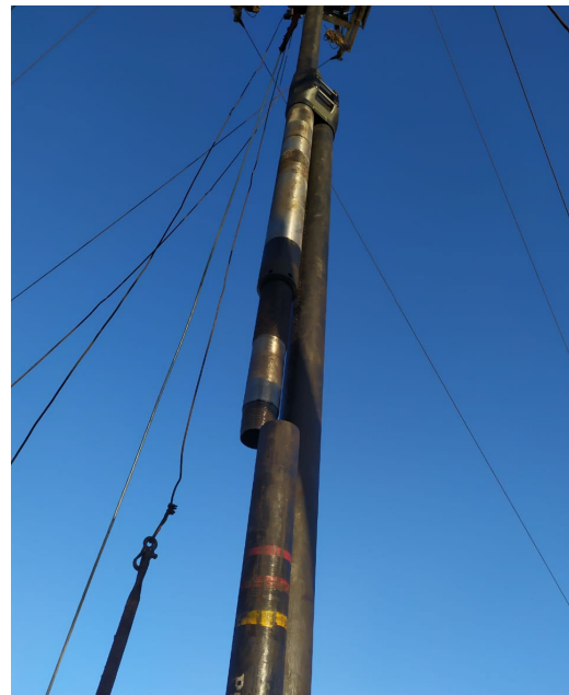
Novomet Y-Tool being connected before running in hole.

The power dump flood solution is ideal for use in offshore, small, or environmentally sensitive fields where surface footprint size can be an issue. It enables customers to use downhole water to create the reservoir pressure needed to boost production.